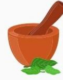
Mortar And Pestle